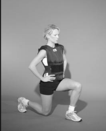
Variation 1 Same positions with a longer stride. Variation 2 Same positions except step to the right and/or left.