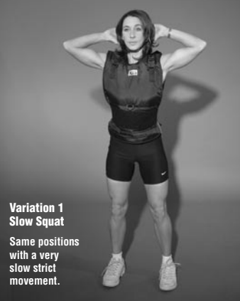
Variation 1 Slow Squat Same positions with a very slow strict movement.

Stand in a ready position with feet slightly outside the shoulder with your feet in a neutral position, at a 20 degree laterally rotated position. Begin with your hips and knees flexed, your trunk should lean forward slightly while stabilizing the trunk. Bend the knees and lower the body. The optimal position of the knees would be 90 degrees, but you must always maintain proper body position. When you have lowered your body to the positional goal, pause for a moment then begin to extend the legs raising back to original starting position, the weight should be over the ankle and felt in the heel of your foot. Repeat to desired goal.