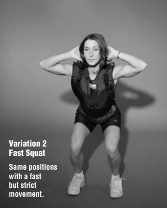
Variation 2 Fast Squat Same positions with a fast but strict movement.